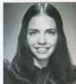
BECI DAILY Union Gas System