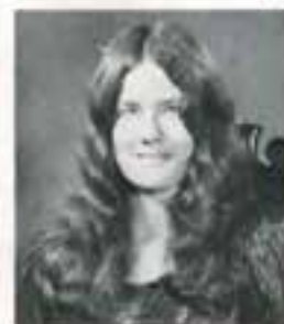
ARDITH SCHENK Alford's "The Flower Shop"