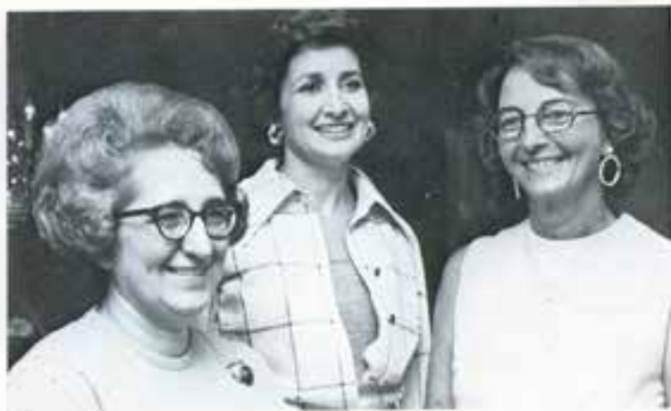
QUEEN CANDIDATES & PUBLICITY